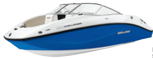
Riviera Blue SE model shown