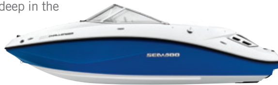
Riviera Blue SE model shown

While the measurements say it's 18 feet, one ride might tell you otherwise. Its engine is set deep in the hull to open up space onboard so plenty creature comforts could be packed into its compact frame. And newly added iTC™ technologies like Docking mode, ECO™ mode, and Cruise control complement the supercharged engine designed for performance.