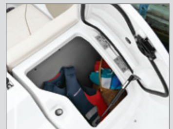
Dual rear storage

While the measurements say it's 18 feet, one ride might tell you otherwise. Its engine is set deep in the hull to open up space onboard so plenty creature comforts could be packed into its compact frame. And newly added iTC™ technologies like Docking mode, ECO™ mode, and Cruise control complement the supercharged engine designed for performance.