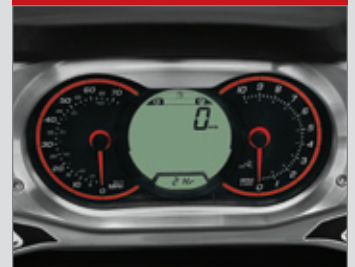
Gauge with Cruise control and ECO mode