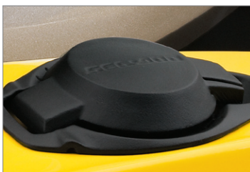
Quick latch fuel filler design