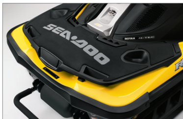
Reboarding platform with storage