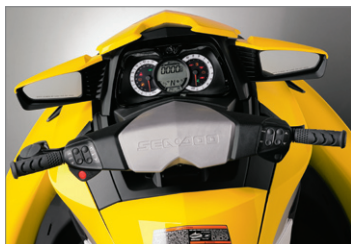
Tilt steering with information center