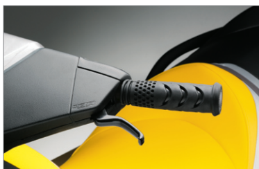
iBR brake lever