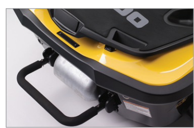
Fold-down reboarding step