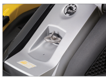
iS (Intelligent Suspension)