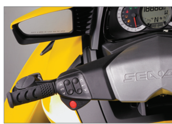
Brake & finger throttle