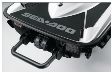
Fold-down reboarding step