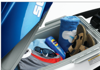
Watertight removable storage bin