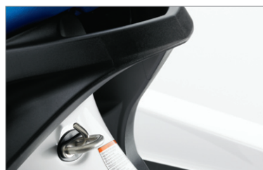
Ski tow eye